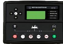
DSE-7320 Remote Control Panel